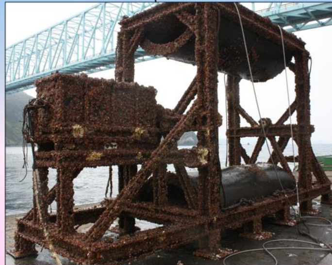
Recovered on April 18, 2013