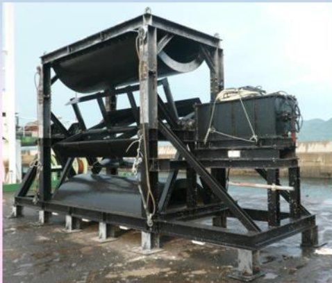
Darrieus Savonius Turbine Deployed on Aug. 27, 2012