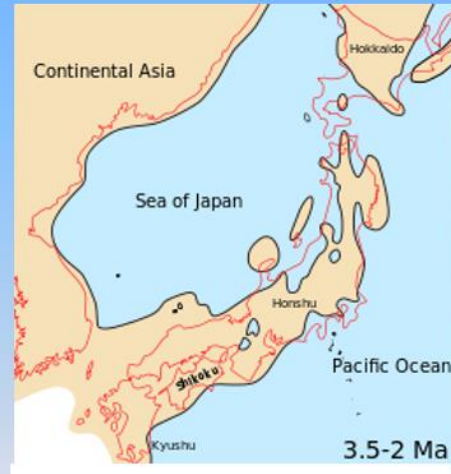
Middle Pliocene to Late Pliocene